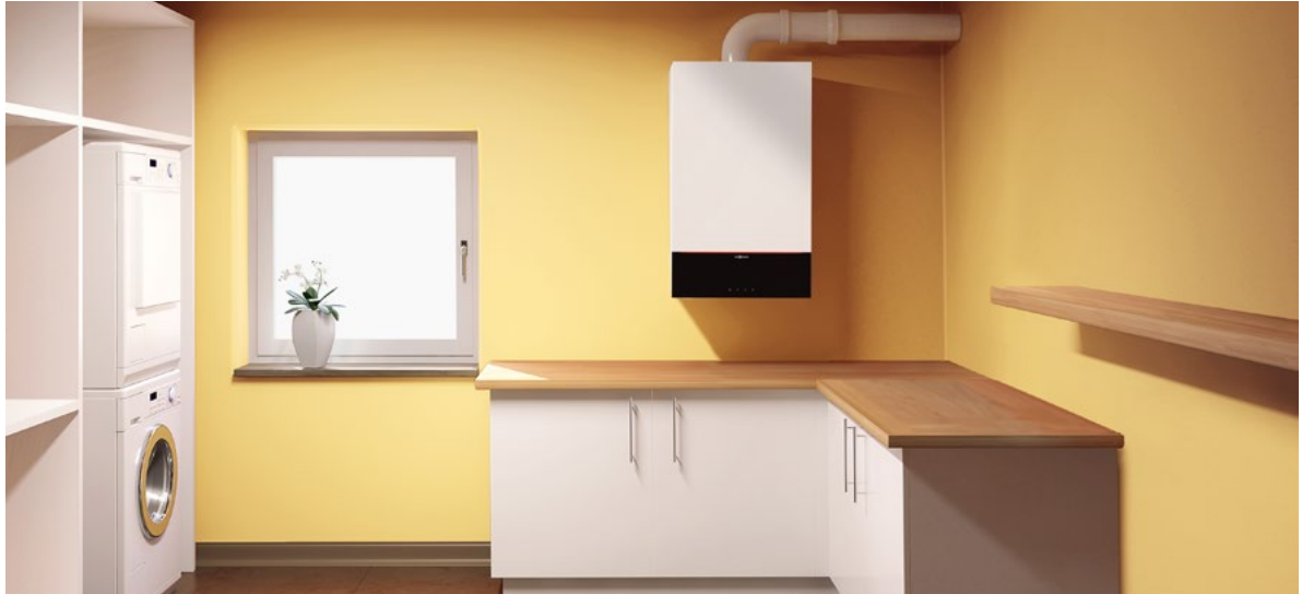
The Vitodens 100-W offers a reliable, compact solution for heating and on-demand domestic hot water (B1KE)

Equipped with a Viessmann stainless steel heat exchanger for lasting performance and reliability, plus a fully modulating Matrix Plus cylinder gas burner, the Vitodens 100-W wall-mounted condensing boiler is the perfect combination of value, quality and Viessmann technology.