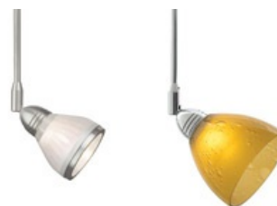
With Round Glass Shield Accessory