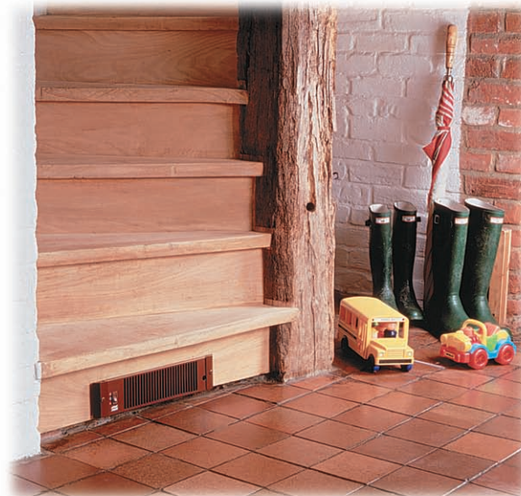
A QUIET-ONE 2000 Series mounted in stairs