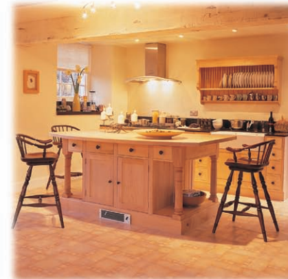
A QUIET-ONE 2000 Series in the cabinet of a kitchen island