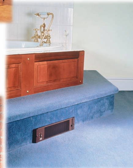
A QUIET-ONE 2000 Series installed in a bathroom