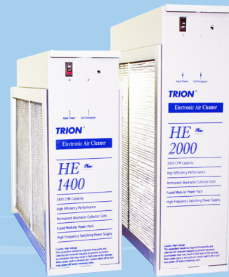
HE Plus 1400 HE Plus 2000

Available in two sizes and capable of cleaning 1,400 to 2,000 cubic feet per minute (CFM), TRION® air cleaners feature a standard, built-in airflow sensor so that the air cleaner is only running when the heating or air conditioning equipment is running to reduce energy consumption.