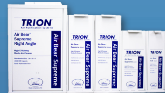
Media Air Cleaners