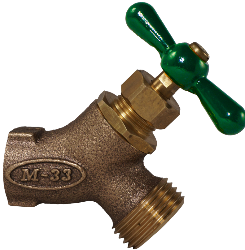
33 Series No-Kink Hose Bibbs