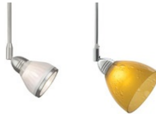
With Round Glass Shield Accessory