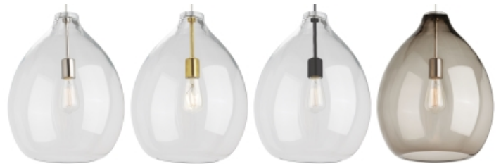
Clear/Satin Nickel Incandescent

Rated for (1) 60 watt max, E26 medium base lamp (Lamp Not Included). LED includes (1) 120 volt 3.5 watt, 263 delivered lumen, 2700K, medium base LED vintage squirrel cage lamp. Dimmable with most LED compatible ELV and TRIAC dimmers. Black ships with six feet of field-cuttable black cloth cord. Satin Nickel ships with six feet of field-cuttable cable.